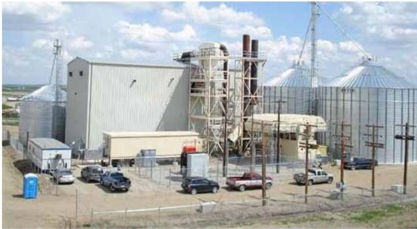
The WasteRenew™ facility in Alberta, Canada is located on a 25,000 head feedlot.